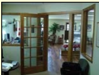
Beautiful Office and Kitchen Finishes