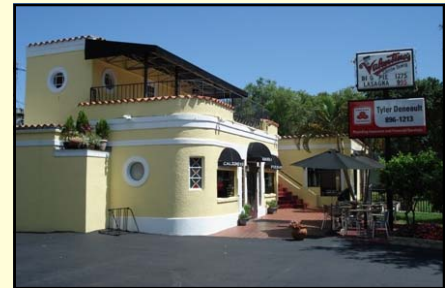
On-site restaurant and executive suite